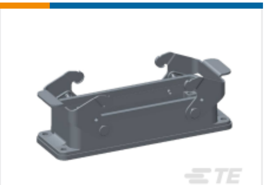
TE Part #T1410242000-000 H24B-AG