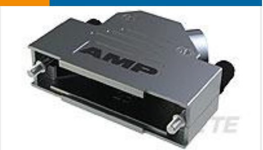
TE Part #1-1478763-5 METAL BACKSHELL 15 WAY 45 DE