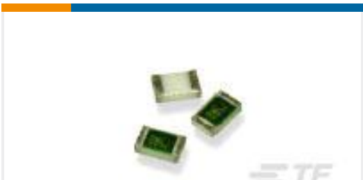
TE Part #4-1879208-5 CPF 0402 680R 0.1% 25PPM 1K RL