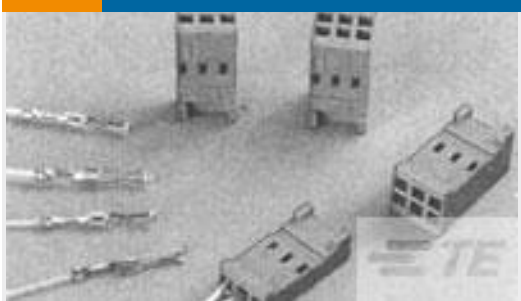
TE Part #281838-6 HOUSING HE13 HE14 COSI 6 P