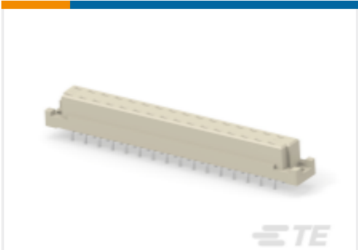
TE Part #354646-E STVD 32 F AC GG 7-02 EE 4,5 * 247 E 172