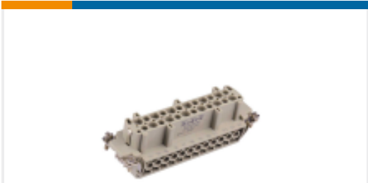
TE Part #T2040242201-000 HE-024-F