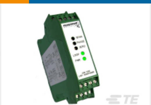
TE Part #02291333-000 LDM-1000 LVDT CONDITIONER DIN