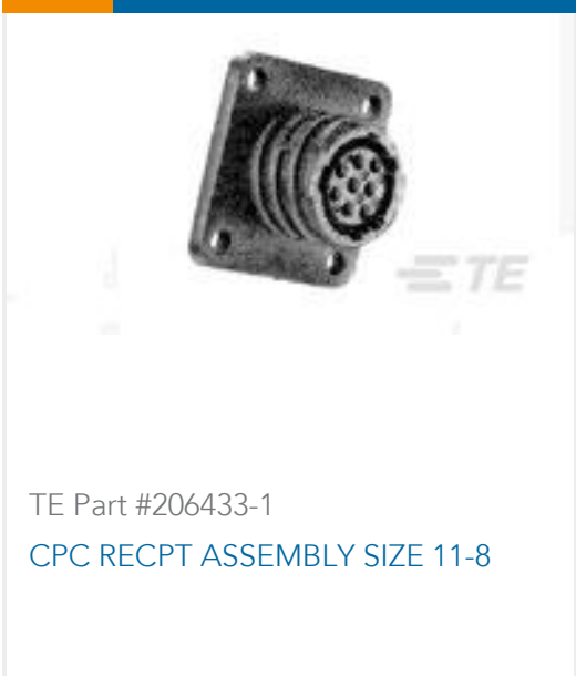
TE Part #206433-1 CPC RECPT ASSEMBLY SIZE 11-8