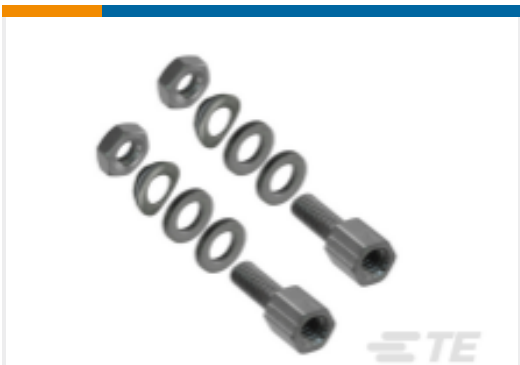
TE Part #1-1393560-8 V42254A 122V 1=SUB D BOLZENZA