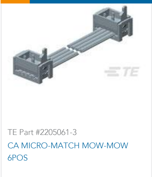
TE Part #2205061-3 CA MICRO-MATCH MOW-MOW 6POS