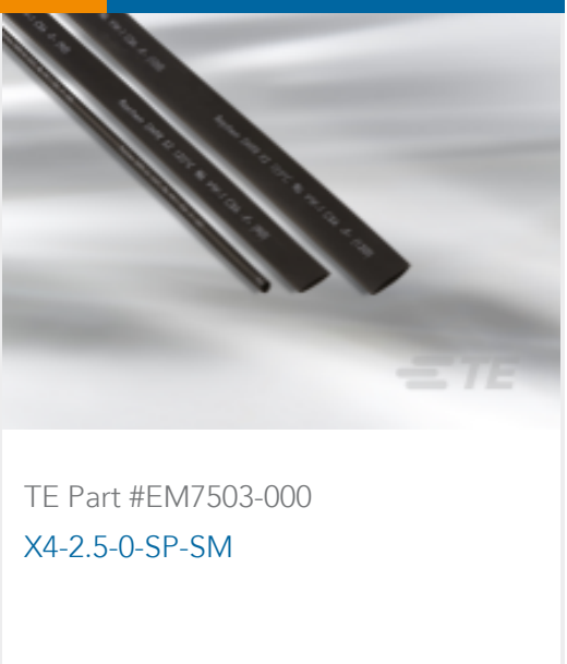
TE Part #EM7503-000 X4-2.5-0-SP-SM