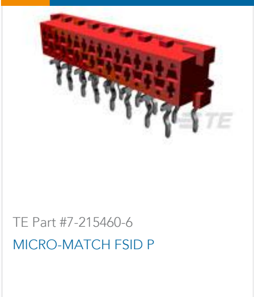
TE Part #7-215460-6 MICRO-MATCH FSID P