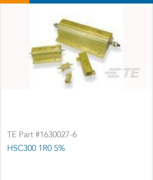
TE Part #1630027-6 HSC300 1R0 5%