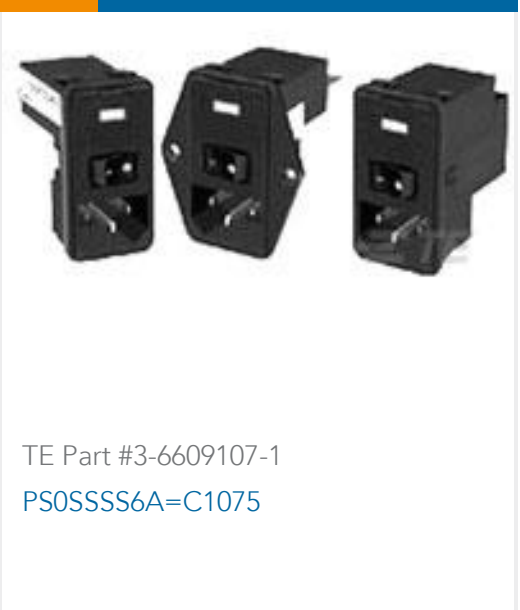
TE Part #3-6609107-1 PS0SSSS6A=C1075