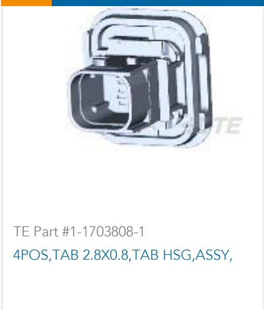
TE Part #1-1703808-1 4POS,TAB 2.8X0.8,TAB HSG,ASSY,