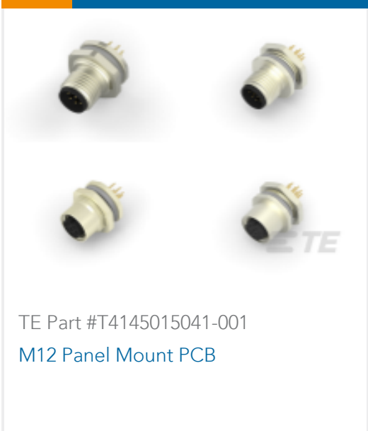
TE Part #T4145015041-001 M12 Panel Mount PCB