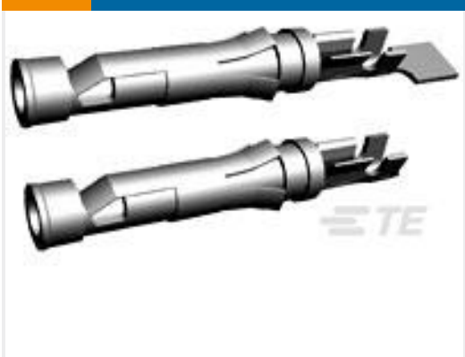
TE Part #1-66101-9 III+ SKT,18-16,TIN ,LP