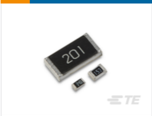
TE Part #2176328-3 CRGP 1206 15R 1%