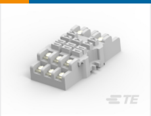
TE Part #1393143-5 27E121=SOCKET,KUP,11,SCW,PLE