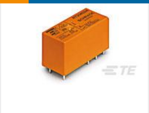
TE Part #1-1649329-5 RT424024