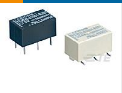
TE Part #2-1393774-0 V23026C1051B201