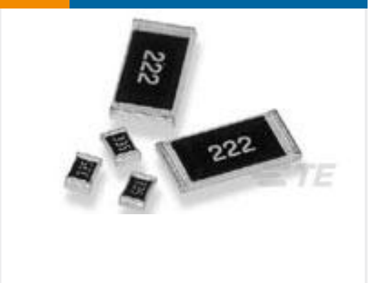
TE Part #1623231-1 CRG0805 1% 470K