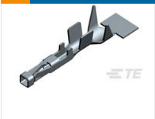
TE Part #2008625-1 Socket Micro MNL, TIN 22-18 AW